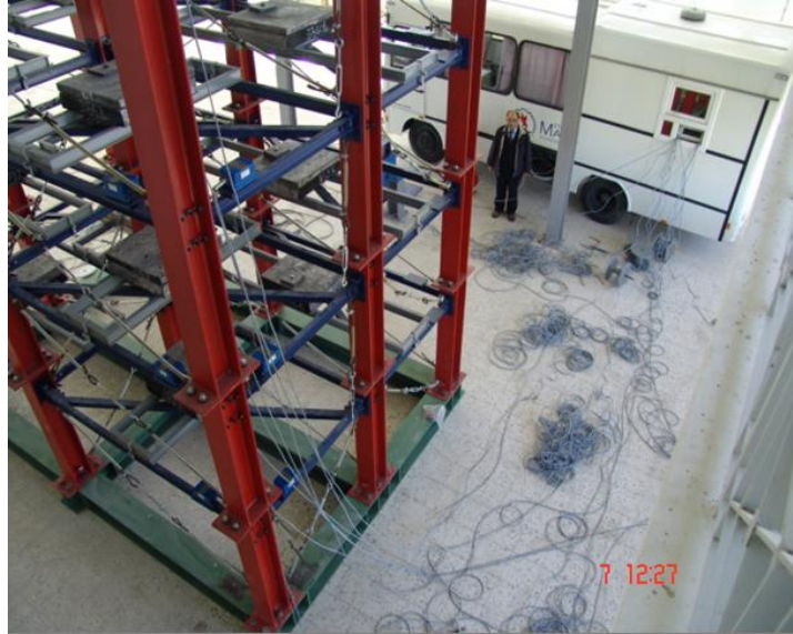
Figure 1. Mobile structural monitoring system and steel frame benchmark structure.

appropriate software and necessary instruments for structural monitoring are placed in mobile vehicle designed in scope of the research project MF-046 and use as mobile structural monitoring system (Figure 1 and website: http://www2.omu.edu.tr/akademikper.asp?id=1528 ). Response of the structure from ambient vibration is presented in Figure 2 and Figure 3 respectively.